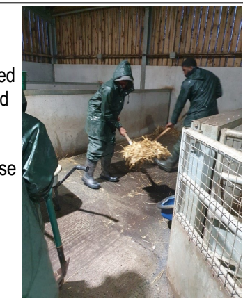
With the pigs at East Shallowford