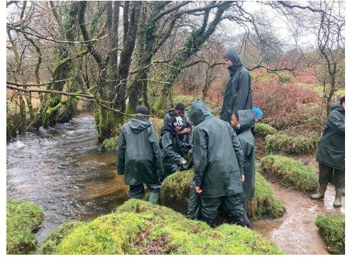
Exploring the West Webburn

We have a had car-load of teenage girls from south London, a youth group from Ashburton, a church group from Exmouth, several school groups from Bristol, Torbay and Plympton, and of course a group of young people from Providence House, Battersea. This group includes a leader who first came herself as a schoolgirl to East