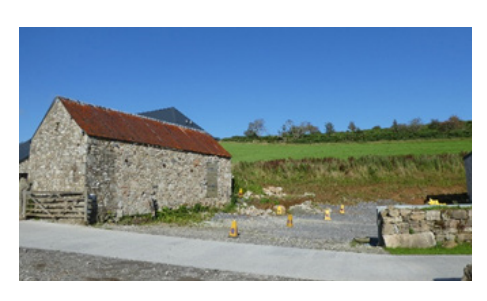
The cones mark the area of the planned new lean-to barn.

restored heavy rocks from fallen walls, collected seeds from flowers which will have names and not just be things to fling at each other. Respect, the vast interweaving of humanity in our complex natural world...... we get there in the end one way or another.