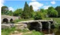
The Old Clapper Bridge, Postbridge